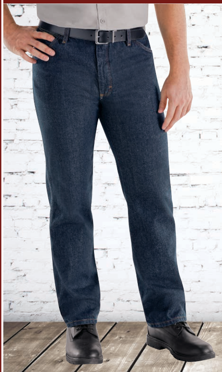
PD52 - Western Styling