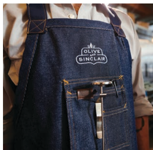
Hanging top pocket