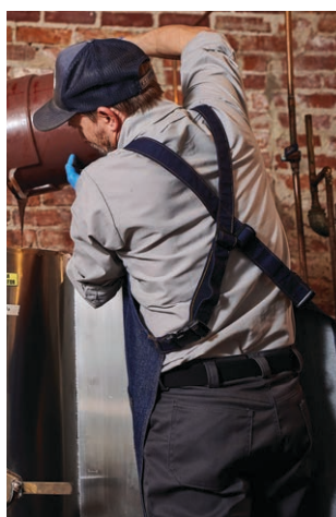
Adjustable suspender back with side buckle