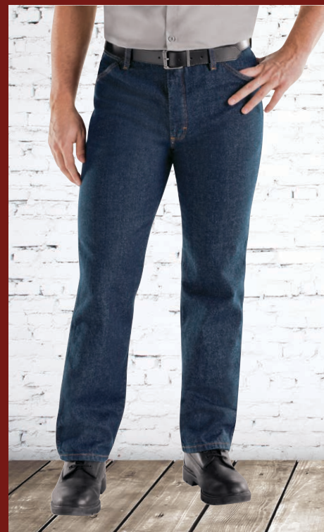
PD54 - Western Styling