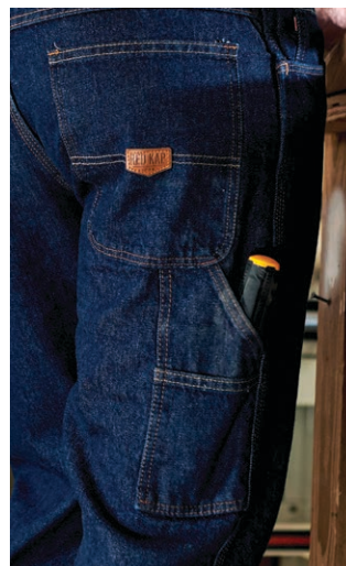
Double rule pocket